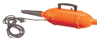
14427 - Quick Inflate Pump (Sold Separately)