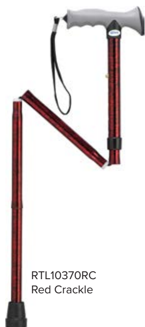
RTL10370RC Red Crackle